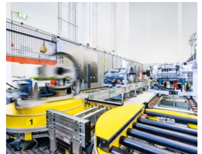
Intelligent transport system