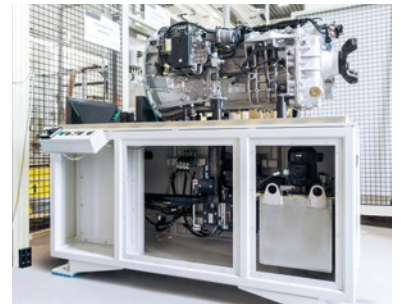
External oil drain station