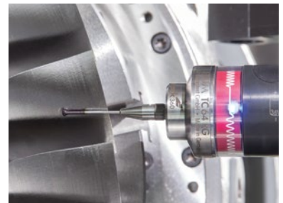
Process-integrated roughness measuring on a blisk