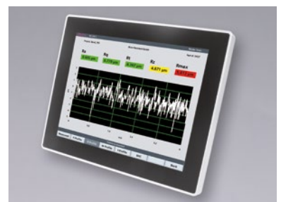
Analysis on control monitor or BLUM touch panel