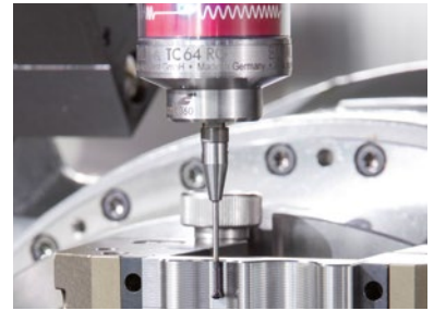
TC64-RG – Roughness measurement in the machining centre